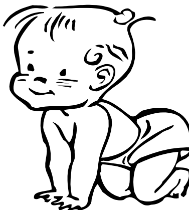
Baby Moses Law

deliver an unharmed child, younger than 60 days, to a designated emergency infant care provider such as a Fire Station, Police Department, or a hospital.